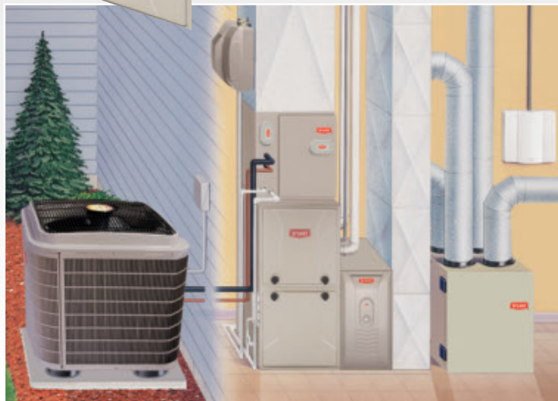
HYBRID HEAT® Dual Fuel Heat Pump and Gas Furnace System

This Box is to be used as a knock-out for a non-varnished area on a full-spread, full-bleed varnish plate.