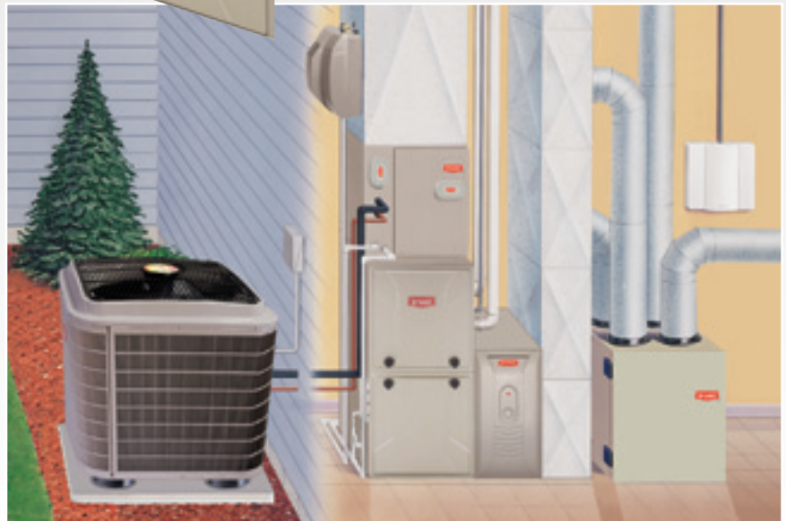
HYBRID HEAT® Deluxe Heat Pump and Deluxe Gas Furnace System