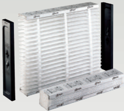
EZ Flex™ Filter