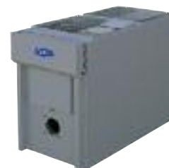
Model OVL Low-Boy

The Models OVM and CVM multi-poise are designed for versatility. With the ability to install in upflow, downflow and horizontal right and left applications, this proven performer is an excellent fit for virtually any home.