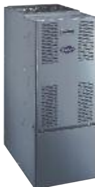
Model CVM Multi-Poise