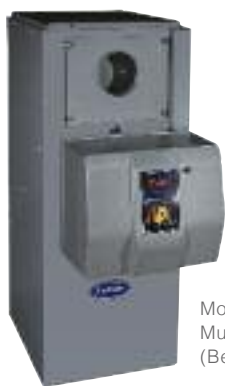
Model OVM Multi-Poise (Beckett Burner)

Industry leadership for more than 100 years doesn't happen by accident. Carrier has maintained its position and reputation through diligent, uncompromising quality control at every stage of a product's life – from concept to completion. Once our product is installed at your home, you can be confident that durable construction and built-in reliability features ensure your comfort for years to come.