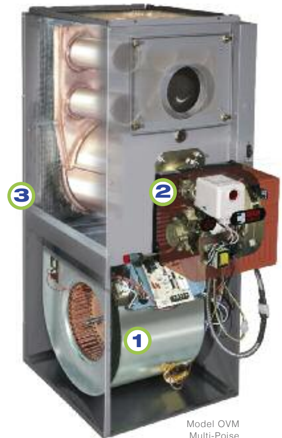
Model OVM Multi-Poise (Riello Burner)