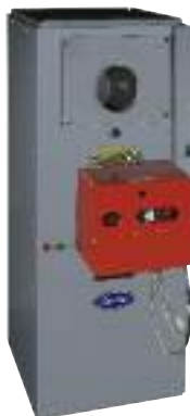
Model OVM Multi-Poise (Riello Burner)